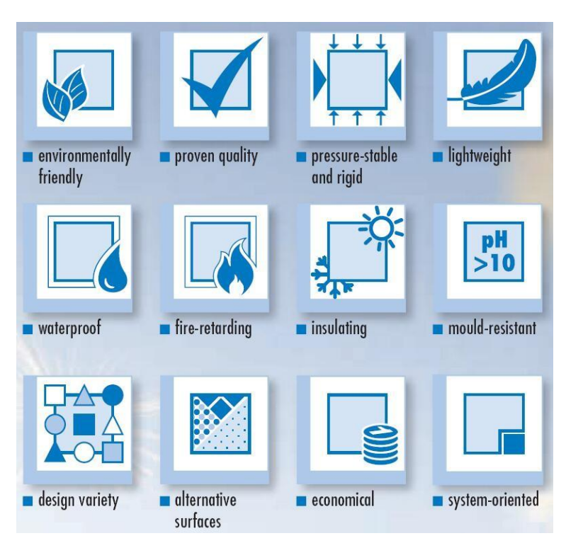
do harm to environment and body